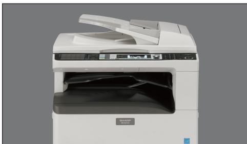
MX-M232D shown with standard 40-sheet Reversing Single Pass Feeder.