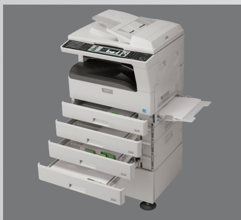
MX-M232D shown with optional 2 x 250-sheet paper feed unit and deluxe low cabinet.