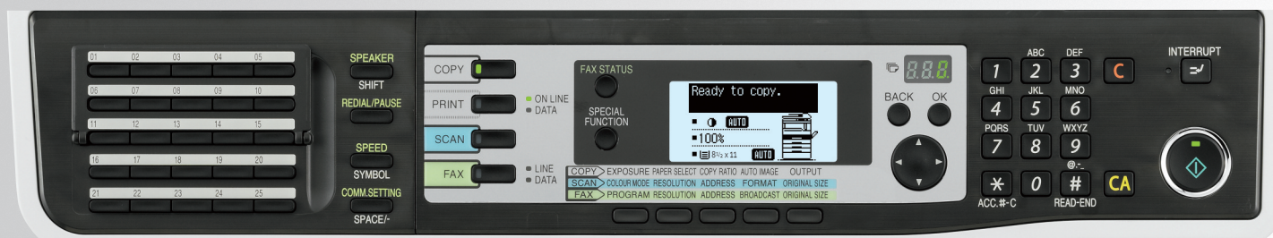
MX-M232D Control Panel.

Maximize capabilities of your MX-M232D with optional full-color network scanning and feature rich network printing! With simple plug-and-play operation, the optional full-featured Network Expansion Kit offers PCL6 and PS3 network printing, walk-up scanning, web-based device management and more. With Sharp's easy-to-use utilities and driver software, the versatile MX-M232D can easily integrate into an existing network environment.